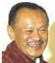
H.E. JIGMI Y. THINLEY Prime Minister

In 1865, Britain and Bhutan signed the Treaty of Sinchulu, under which Bhutan would receive an annual subsidy in exchange for ceding some border land to British India. Under British influence, a monarchy was set up in 1907; three years later, a treaty was signed whereby the British agreed not to interfere in Bhutanese internal affairs and Bhutan allowed Britain to direct its foreign affairs. This role was assumed by independent India after 1947. Two years later, a formal Indo-Bhutanese accord returned the areas of Bhutan annexed by the British, formalized the annual subsidies the country received, and defined India's responsibilities in defense and foreign relations. In March 2005, King Jigme Singye WANGCHUCK unveiled the government's draft constitution - which would introduce major democratic reforms - and pledged to hold a national referendum for its approval. In December 2006, the King abdicated the throne to his son, Jigme Khesar Namgyel WANGCHUCK, in order to give him experience as Head of State before the democratic transition. In early 2007, India and Bhutan renegotiated their treaty to allow Bhutan greater autonomy in conducting its foreign policy. Democratic Elections for seats to the country's first parliament were completed in March 2008. The King ratified the country's first constitution in July 2008.