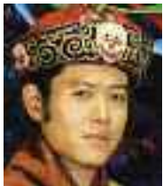
H.M. JIGME KHESAR NAMGYEL WANGCHUCK King