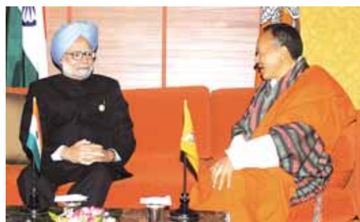
Prime Minister Dr. Singh with Jigmi Y. Thinley, Prime Minister of Bhutan.