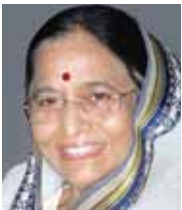
H.E. PRATIBHA PATIL President