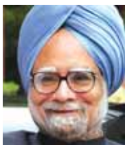
H.E. Dr. MANMOHAN SINGH Prime Minister