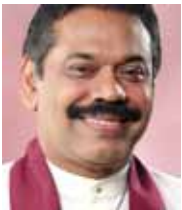
H.E. MAHINDA RAJAPAKSA President