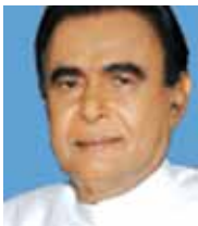
H.E. D.M. JAYARATNE Prime Minister

The first Sinhalese arrived in Sri Lanka late in the 6th century B.C. probably from northern India. Buddhism was introduced in about the mid-third century B.C., and a great civilization developed at the cities of Anuradhapura (kingdom from circa 200 B.C. to circa A.D. 1000) and Polonnaruwa (from about 1070 to 1200). In the 14th century, a south Indian dynasty established a Tamil kingdom in northern Sri Lanka. The coastal areas of the island were controlled by the Portuguese in the 16th century and by the Dutch in the 17th century. The island was ceded to the British in 1796, became a crown colony in 1802, and was united under British rule by 1815. As Ceylon, it became independent in 1948; its name was changed to Sri Lanka in 1972. Tensions between the Sinhalese majority and Tamil separatists erupted into war in 1983. Under the leadership of President Mahinda Rajapaksa, the country got an implausible victory over the terror group.